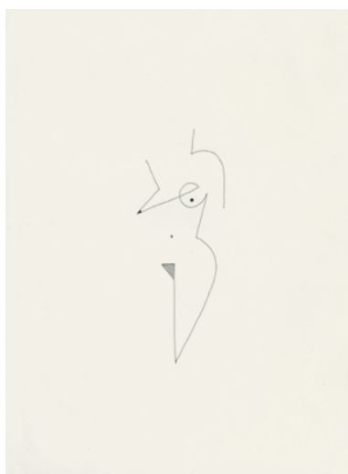
© Blanca Miró, El cuerpo , 2016

The female body, the principal theme represented in Miró's work, materialises in the perfect balance between sharp angles and sinuous curves that are brought together through the use of feminine symbols. This constant revisiting of the figure of Venus reveals a profound concern for redefining the meanings of the feminine today.