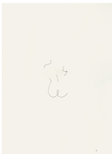
© Blanca Miró, Espalda alegre , 2016