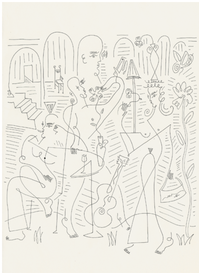
© Blanca Miró, Un sueño , 2019

Opening in the presence of the artist: 26 February 7:30 p.m.