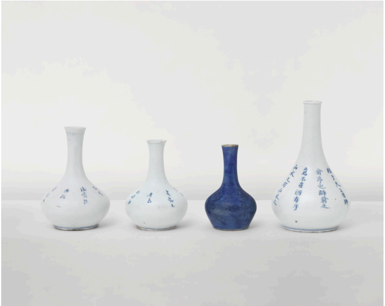
© Bohnchang Koo, EWB 02 , 2019. Porcelain wares courtesy of the Ewha Womans University Museum, Seoul.

Bohnchang Koo (Seoul, 1953) currently lives and works in Seoul, Korea. His work has been shown individually on more than forty occasions and is included in several public collections such as the Asian Art Museum in San Francisco; the Museum of Modern Art in San Francisco; the Museum of Fine Art, Houston; and the National Museum of Modern and Contemporary Art in Korea. He was the artistic director of the Daegu Photo Biennale in South Korea, one of the curators collaborating with Photoquai Paris in 2013, and a nominator of the Discovery Award 2014 at Les Rencontres d'Arles. He currently teaches at Kyungil University in Korea.