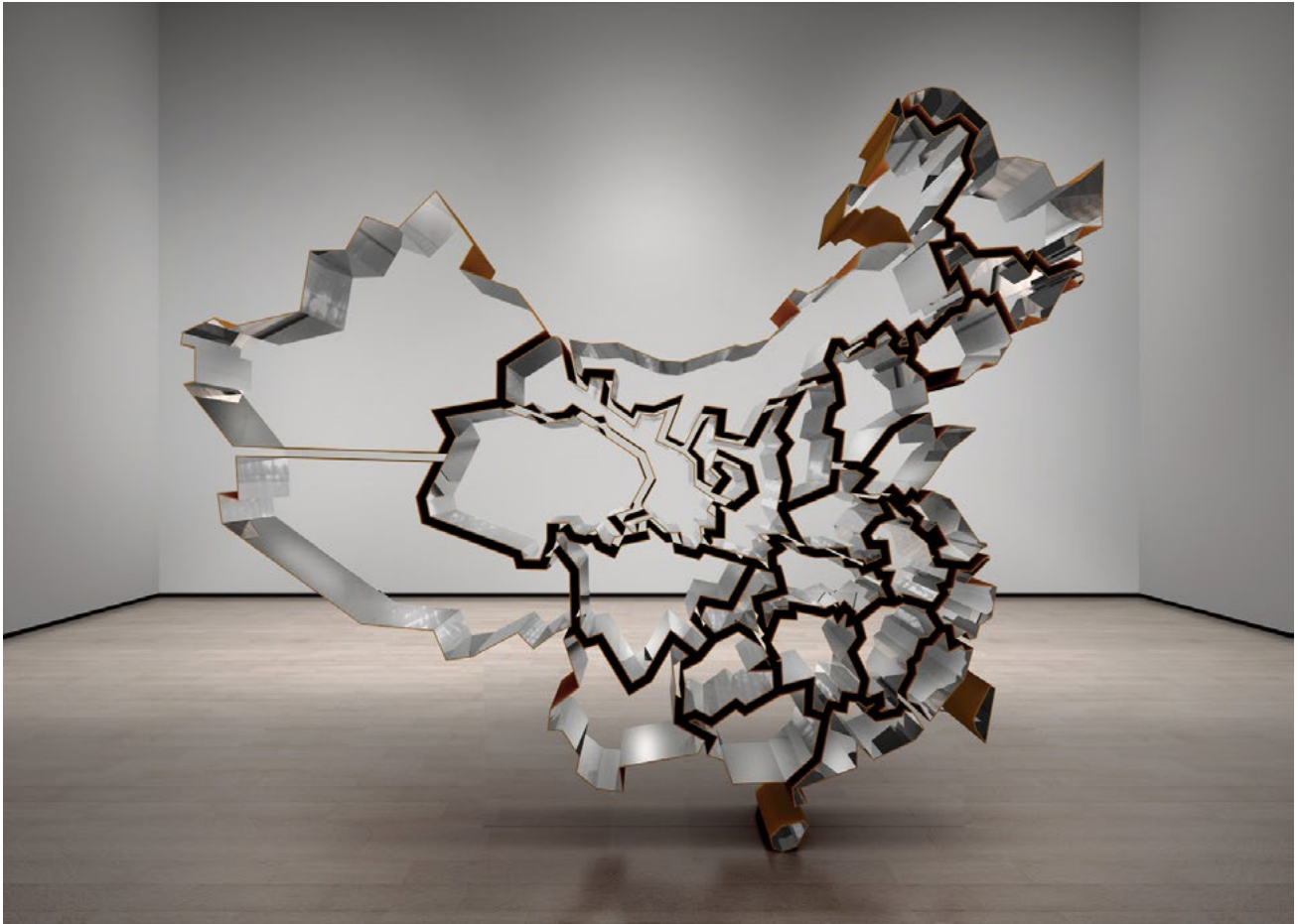
Free Standing China | Ron Arad, 2009 | Courtesy Ivorypress and the artist's studio

The exhibition, which will run until 9 November, shows his singular perspective on architecture, design and the artistic object. With his interest in experimentation as a starting point, Ron Arad studies the expressive possibilities of different materials such as steel, aluminium, Corian and polyethylene.