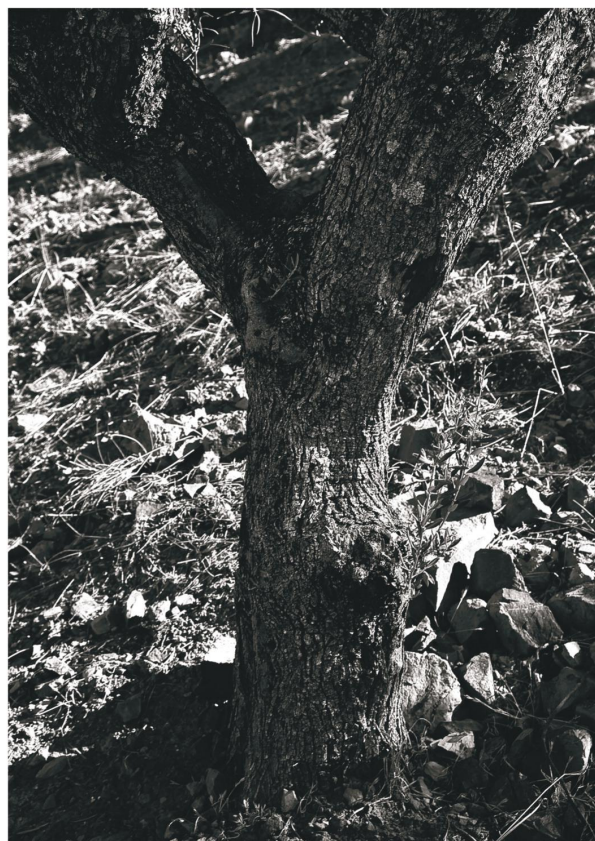
Pedro Cabrita Reis, Tree of Light , 2011

For further information, interviews and image request: