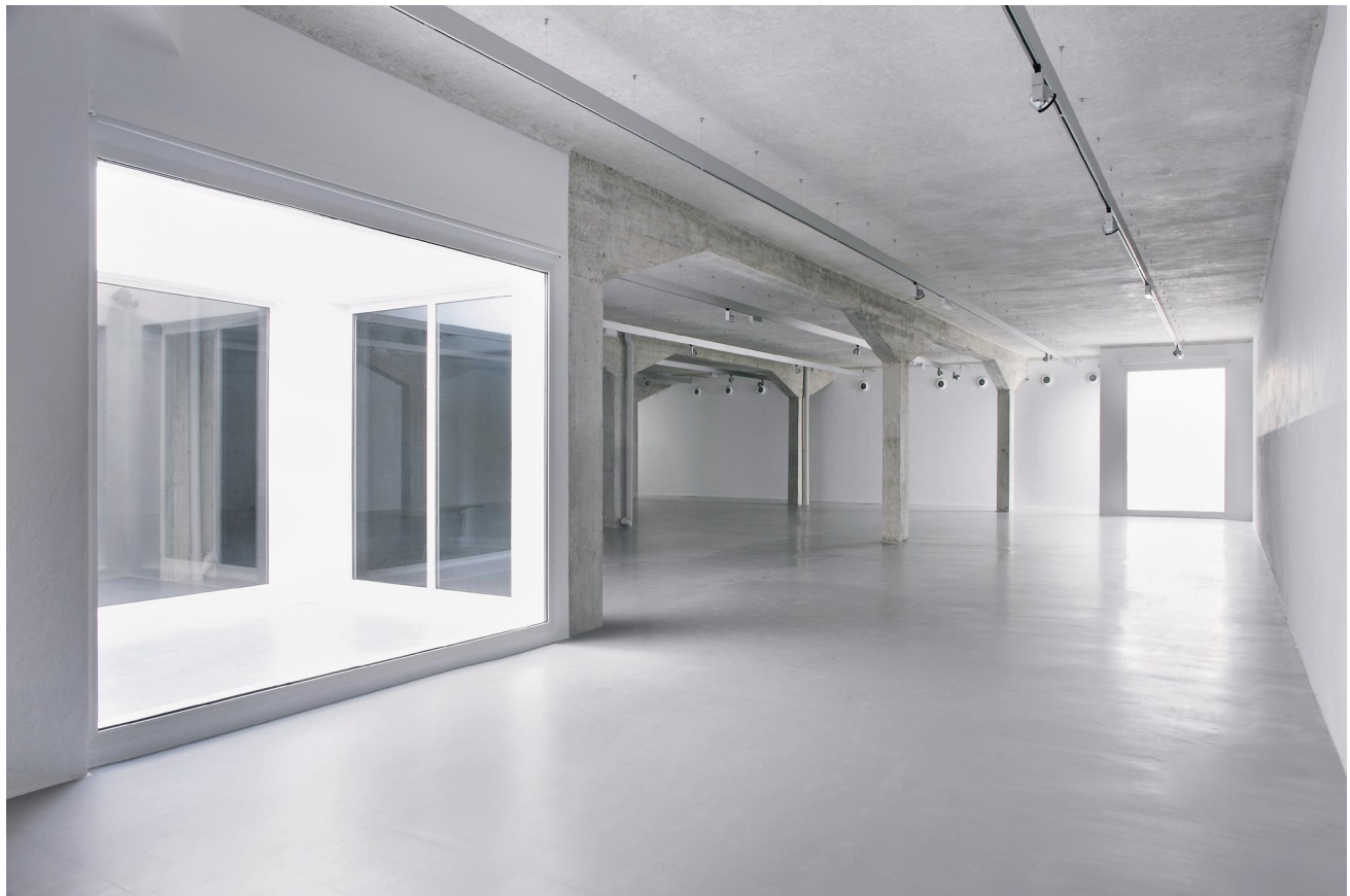
ivorypress exhibition space

Ivorypress was founded by Elena Ochoa Foster in London in 1996 as a publishing house specialising in artists' books. The firm currently encompasses a wide range of areas and activities within the frame of contemporary art, which include its own art gallery, art consultancy and art exhibitions curatorship, editorial services, audio-visual productions and education.