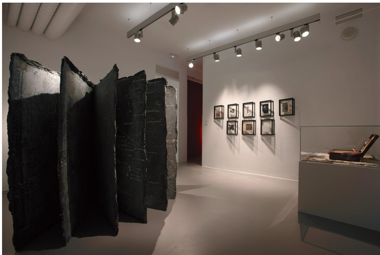
Exhibition of artists' books by Ivorypress