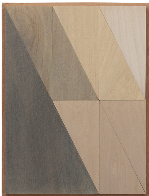
©Felipe Cohen, Broken Light series #76, 2017.