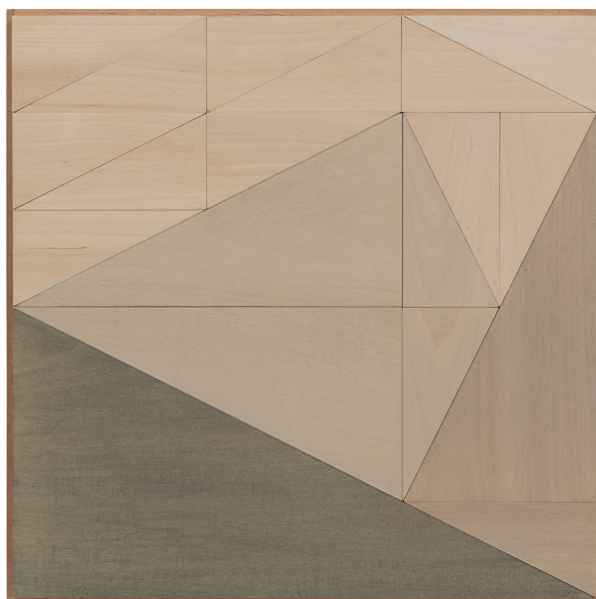
© Felipe Cohen, Broken Light series #61, 2017.

Opening in the presence of the artist: 12 September 2018 at 8 p.m.